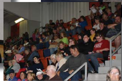
Photos from the 2014 Annual Meeting