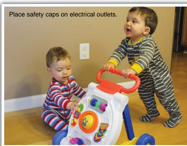
Place safety caps on electrical outlets.

New and improved electronics come out every day to make parenting easier, especially for monitoring a baby in another room. Follow manufacturer recommended safety measures, keeping cords