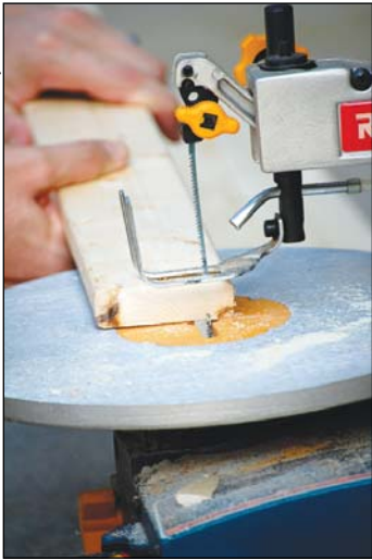
Read power tool instructions and adopt safety measures like using equipment guards, wearing eye and ear protection, and securing long hair and loose-fitting clothing.

Do-It-Yourself (DIY) offers a great way to save money and learn new skills. But before you tackle that home improvement project, practice these safety measures to avoid injury while getting game-winning results.